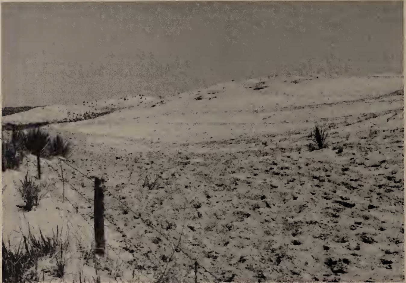
FIG. 2.—Sand dunes on Texas–New Mexico border, Bailey County.

little or no vegetation. As dunes age, they become stabilized with vegetation and a fine-grained topsoil develops (Fig. 3).